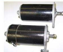
C39 & C40 Dynamo