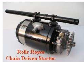
Rolls Royce Chain Driven Starter