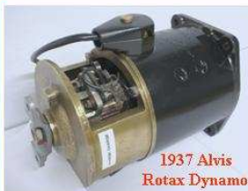
1937 Alvis Rotax Dynamo