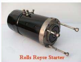
Rolls Royce Starter