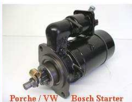
Porche / VW Bosch Starter